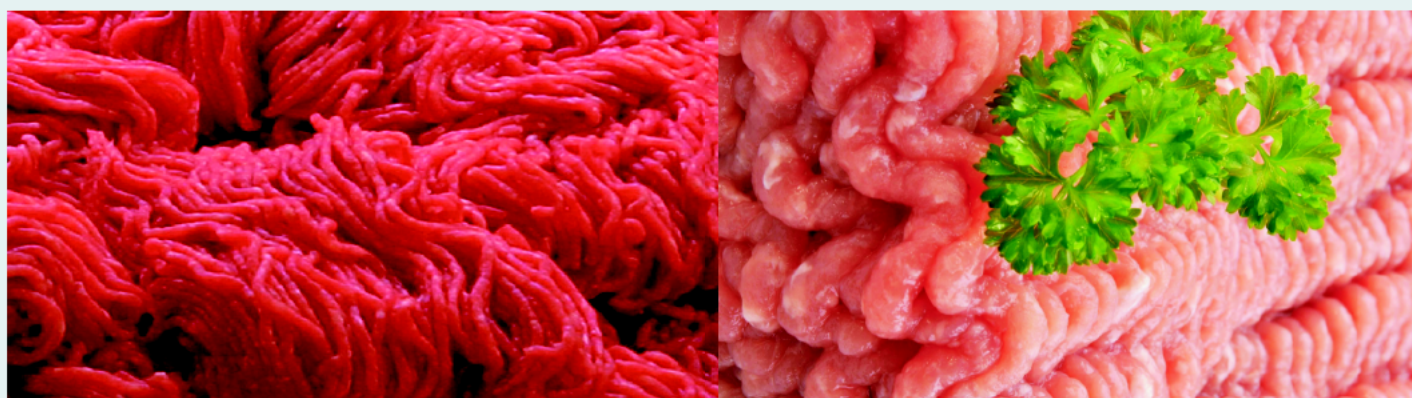
Visually appealing & Long Shelf Life Mince without preservatives