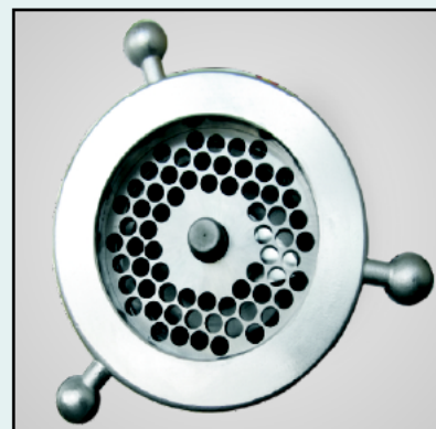
42 Size Cutting Head with 42 Size Worm