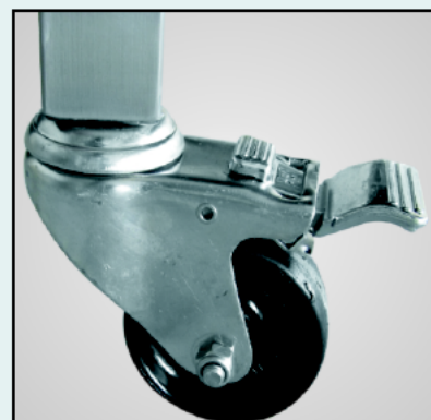
Stainless Steel Casters with Locks