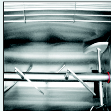
Large Radius Corner ends Removable Stainless Steel Paddle

The highly polished interior hopper and the efficient and removable Mixing Paddle of the Mincer Mixer stops mince sticking to the machine resulting in less wasted product, and easier, quicker clean and better hygiene. The bottom line is more profit to the operator from a higher yield, reduced time to clean and a visually appealing & longer shelf life mince. These features are sure to please every quality & efficiency conscious operator and most importantly their customers.