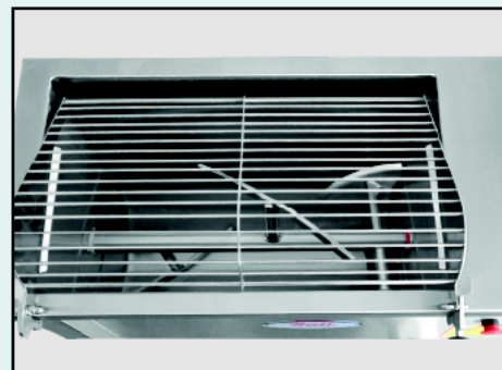
Stainless Steel Grill type Lid

Contact us for a list of un-biased Hall Equipment users in your region/state.